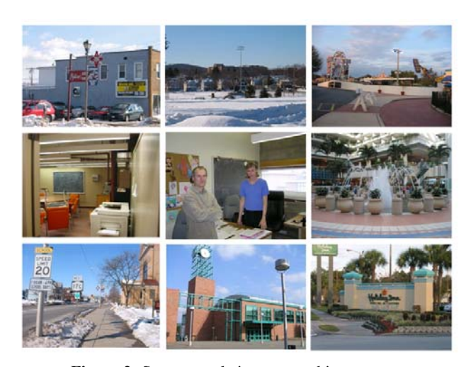
Figure 2: Some sample images used in our tests.